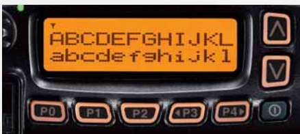
Two line setting display example.

With a high contrast dot matrix display, upper and lower case characters can be easily distinguished. You can change the display setting to show one line and 12 characters, or two lines and 24 characters via programming. LCD backlighting is standard.